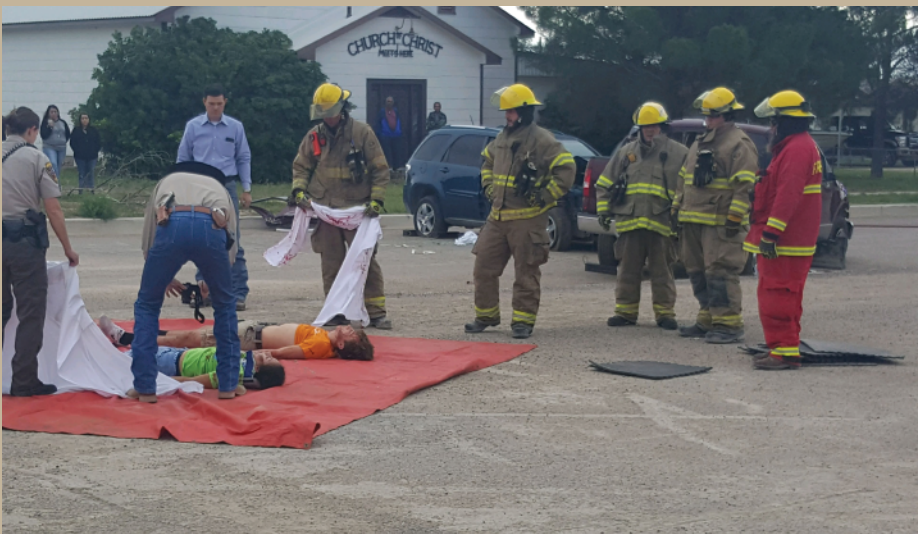
The RCHD EMS crew and medical staff teamed up with Rankin ISD students and Rankin First Responders to hold a “Shattered Dreams” presentation. This presentation is designed to simulate the aftermath of impaired driving. The entire community came together on October 20th to witness this impactful event.